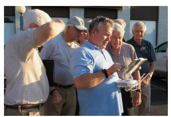
He showed how he controls the drone with the help of an iPad.

If you missed this presentation, you can catch it again at the August Digital Photography SIG on August 27 at 7 p.m.