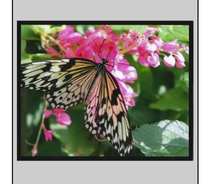
Insects - 2nd Place - Dick Bevevino