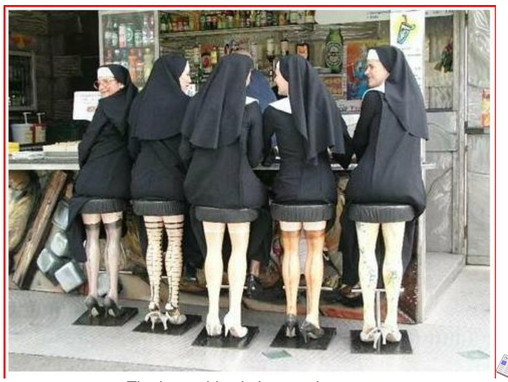
The latest thing in bar stools

http://www.youtube.com/watch?v=PN oDdGmKyA&feature