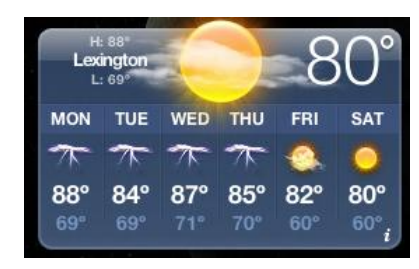
A Mac weather widget

10.5 is the base version of Leopard. Throughout an operating system's life, Apple releases periodic operating system updates. The first Leopard update was 10.5.1 followed by 10.5.2, 10.5.3 and so forth. All of these are Leopard, just different versions.