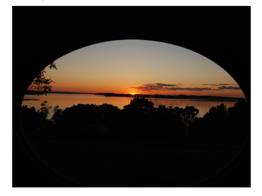
Windows by Jerry Hubble