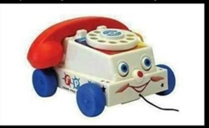
The phone I had when I was six.

The phone my kids had when they were six.