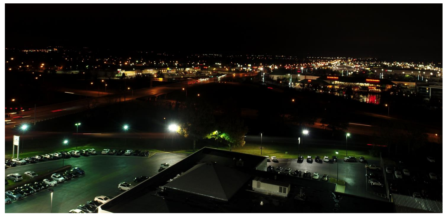
The drone camera's view in a flight from the back lot of the CKCS building shows the top of Don Jacobs Auto building. Just beyond that is the recessed New Circle Road, the lights from the Mall at Lexington Green, the Crossroads and Fayette Mall, Fayette Place and in the far distance, the Summit.